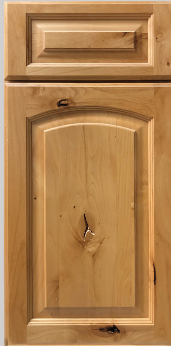
Neoga Ridge Arched