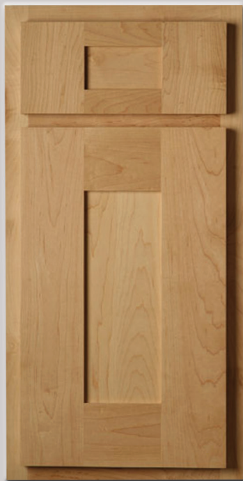
Wide Rail Shaker